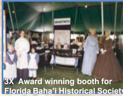
3X Award winning booth for Florida Baha'i Historical Society