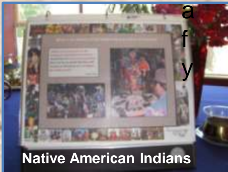
Native American Indians