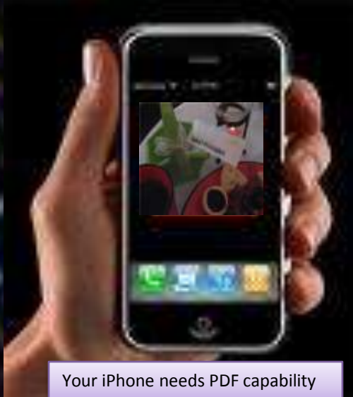
Your iPhone needs PDF capability

.... The details of the presentations will change as on each occasion, different questions are asked and different interests are expressed.