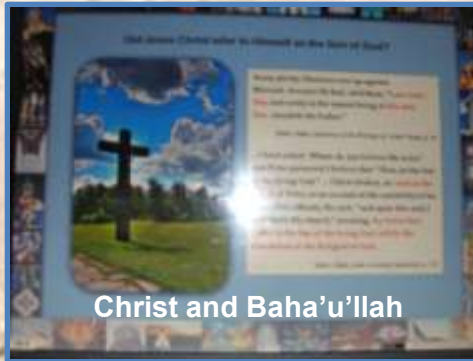
Christ and Baha'u'llah