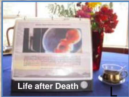
Life after Death